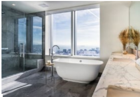
From top: Bathrooms in the Four Seasons Private Residences at Mission Street tower are bathed in natural light; living rooms in the tower condos feature spectacular views of the city; family rooms in tower condos offer distinct areas for quiet moments or intimate conversations with guests.

to create a sense of movement and make the project stand out on the San Francisco skyline.”