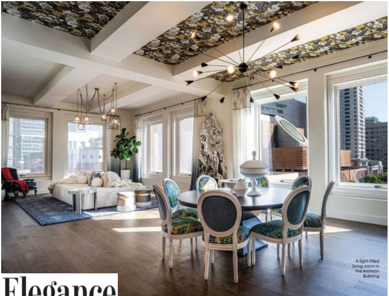
A light-filled living room in the Aronson Building